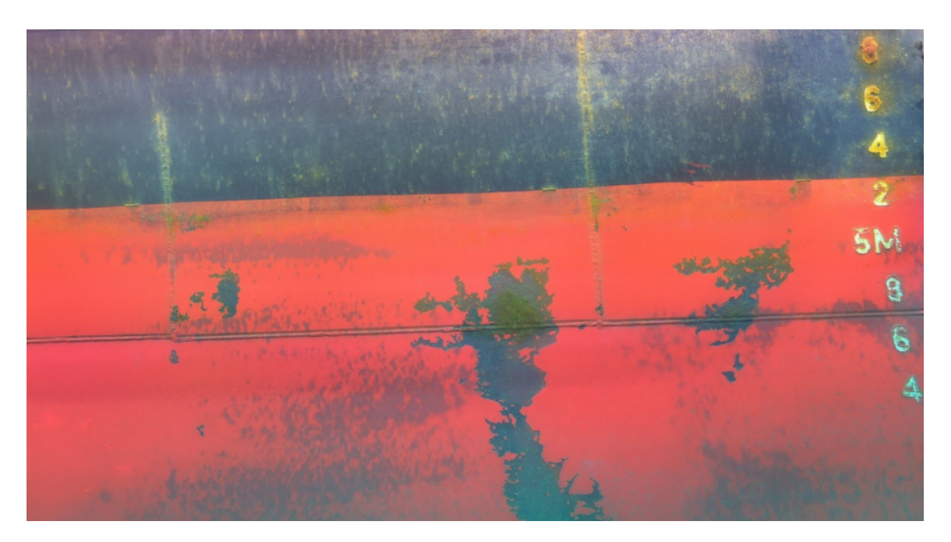
Figure 2 Example of 3D-model generated of side of a vessel, allowing for overview as well as detailed inspection of selected areas.