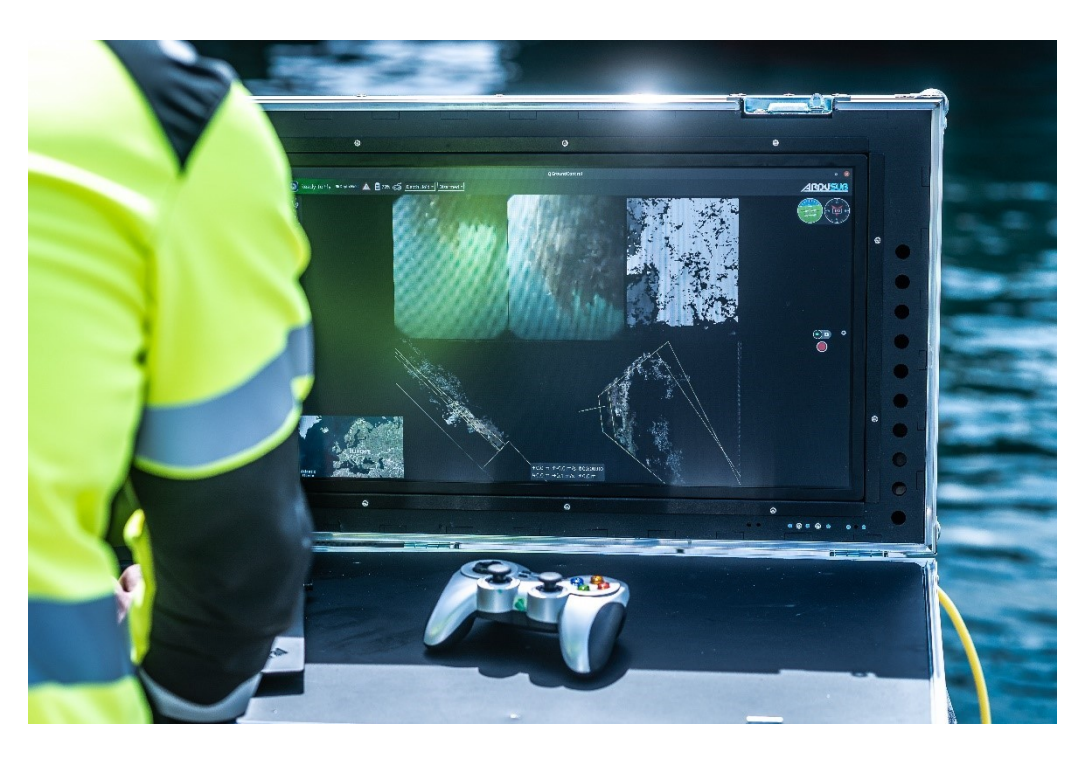
Figure 4 Blue Atlas Sentinus in flight mode, look at the topside monitor as the autopilot allows for a handsfree operations.