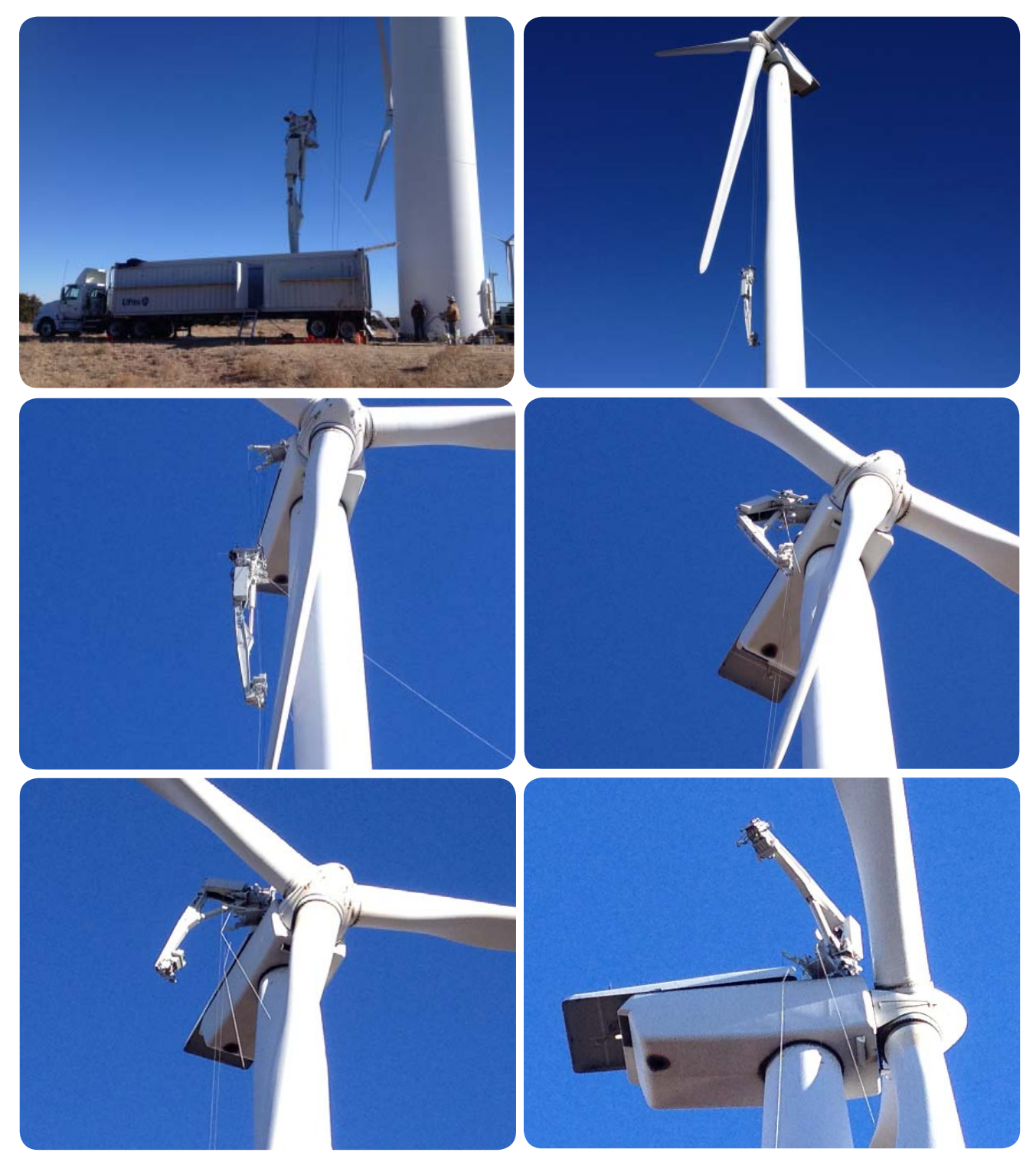
Rising from the container. The Crane climbs up its own lifting wire and installs itself on top of the nacelle.