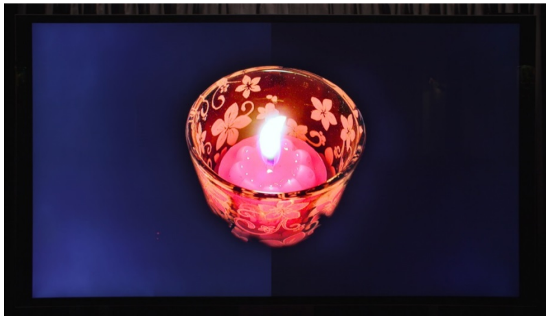
Figure 2. Illustration of dimming vs. no dimming. In the right part local dimming (direct dimming) is applied, whereas in the left part full backlight is used and the leakages of light through the LC pixels are clearly visible.

To illustrate the effects, Figure 2 depicts the effects of dimming vs. no dimming. (The image is composed of two photos of a Bang & Olufsen screen displaying the same image but with and without dimming. The left part is from the set-up with no dimming and the right part from the set-up with dimming.) The dimming directly gives energy savings.